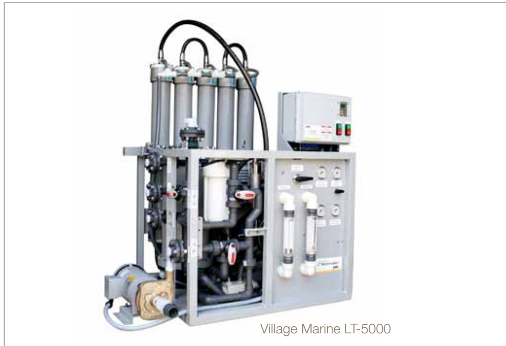
Village Marine LT-5000

Racor VMT LT systems have a base frame only 40" wide x 33" deep, allowing a high capacity and high quality watermaker installation in a tight space.