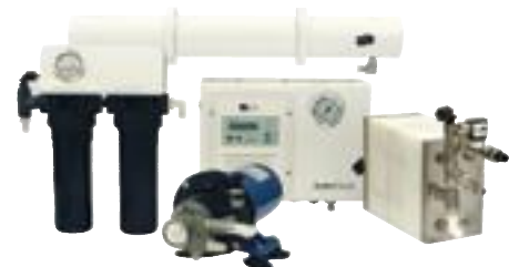
Quest - modular