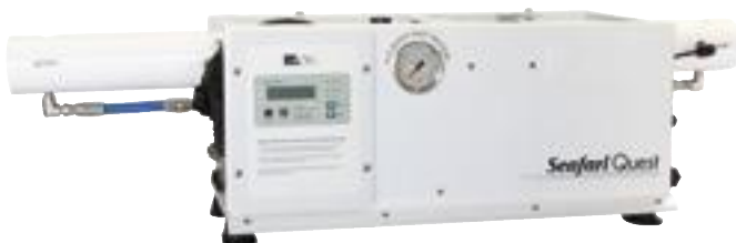
Quest - compact