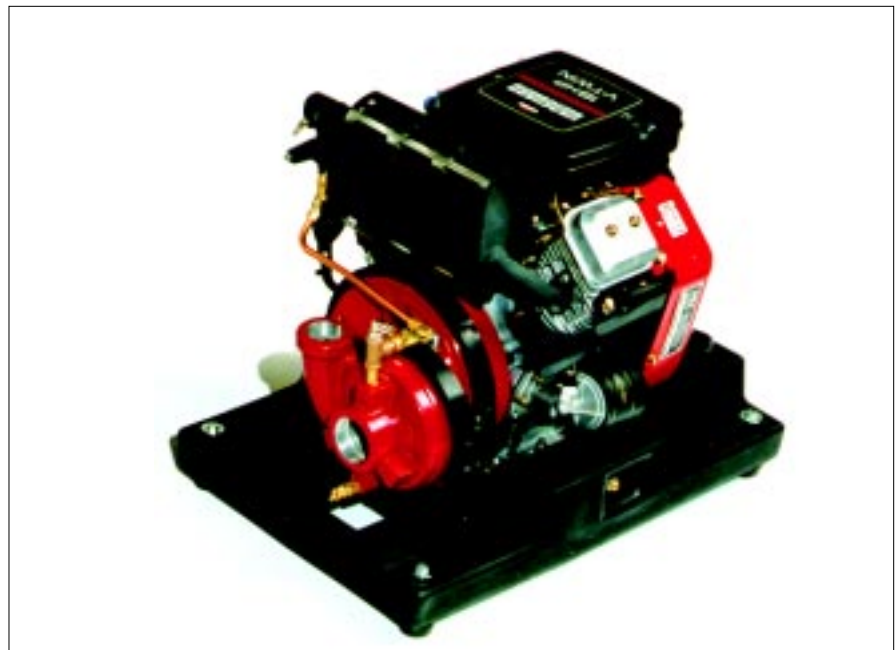
Shown with optional base fuel tank

Briggs & Stratton Vanguard Engine—Quiet and powerful.